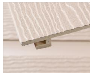
EMBOSSED SHIPLAP CLADDING

Available in shiplap and featheredge styles, embossed cladding is designed for easy installation. Our range of colours and realistic woodgrain finishes means you can create a truly unique appearance, whether you want a rustic timber-effect or a crisp contemporary white finish.